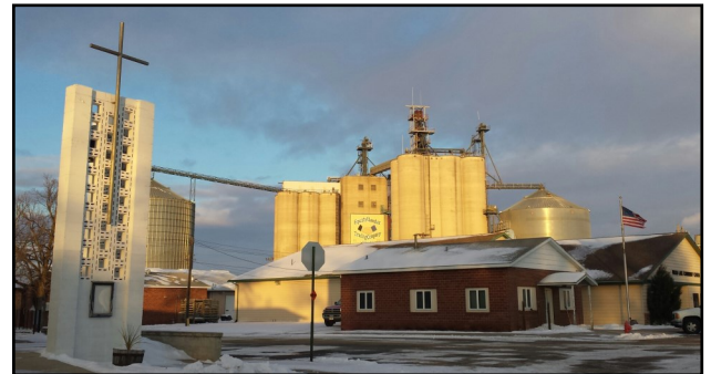
Equity Elevator & Trading Co. is located in "God's country" near one of Wood Lake's churches.

Equity Elevator & Trading Co. has been a coop for over 102 years and is part of the Minnesota Grain & Feed Association's Century Club!