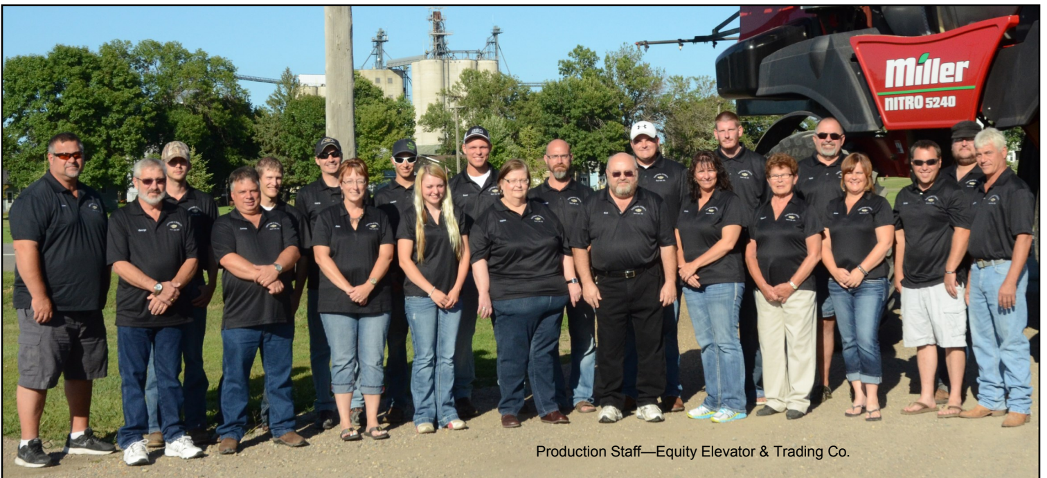
Production Staff—Equity Elevator & Trading Co.